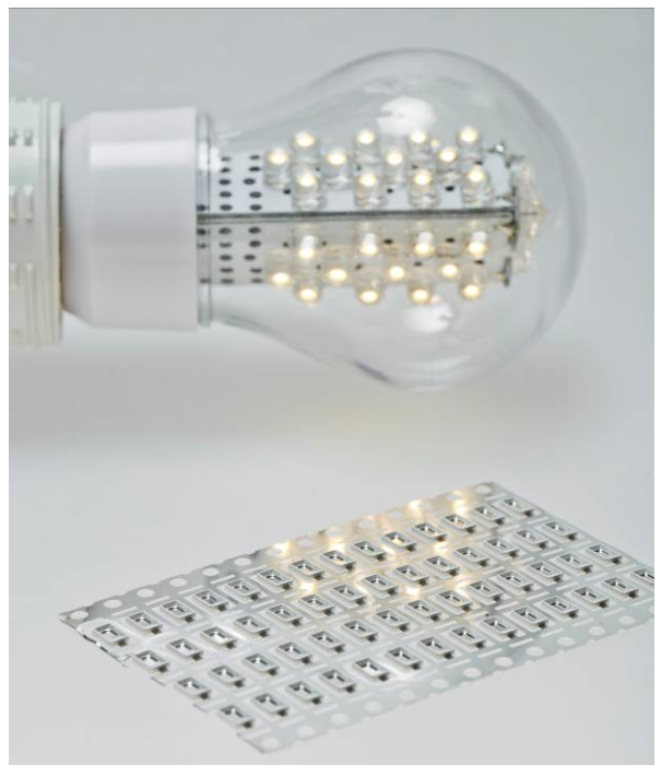
Reflector sockets made using VESTAMID® HT plus allow fabrication of even the smallest LEDs.

It is the reflector socket into which the actual light-emitting diode is mounted that largely determines the effectiveness of LED light yield as well as the durable life of the LED. To achieve consistent light yield requires a high degree of reflection, meaning a pure-white plastic socket. Over time, the rate of reflection will decline considerably if the reflector socket is made of inferior material. And thus the lifespan of the LED would be reduced, too. Reflector sockets made of VESTAMID® HT plus remain significantly whiter even over a long period, enabling the LED to keep shining brightly. The good flowability of this material also facilitates miniaturization, making it possible to create even extremely small LEDs.