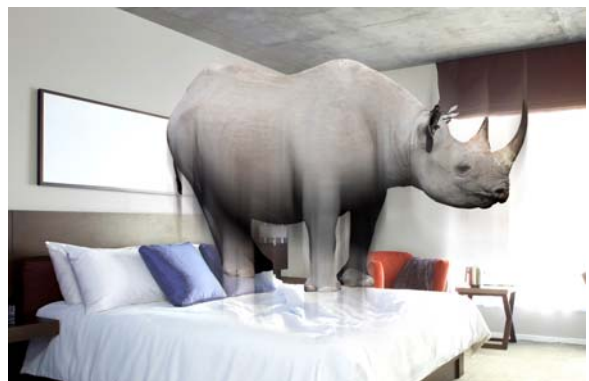
There must be something at the bottom of it! Could it be VESTAMID®E?

PA 12 elastomers, the most important subgroup of polyamide elastomers, belong to the increasingly important material class of thermoplastic elastomers (TPE). Because of their excellent properties, they are indispensable in many applications. Evonik markets its PA 12 elastomers under the brand VESTAMID® E.